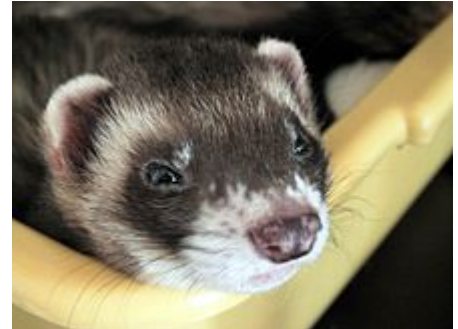
Typical ferret coloration, known as a sable or polecat-colored ferret

Gaston Phoebus' Book of the Hunt was written in approximately 1389 to explain how to hunt different kinds of animals, including how to use ferrets to hunt rabbits. Illustrations show how multicolored ferrets that were fitted with muzzles were used to chase rabbits out of their warrens and into waiting nets.