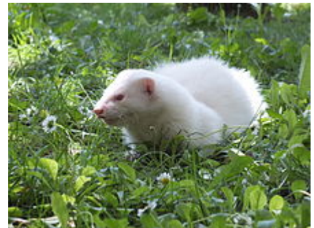
White or albino ferret