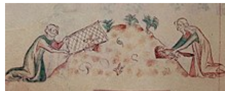
Women hunting rabbits with a ferret in the Queen Mary Psalter

Ferrets were first introduced into the New World in the 17th century, and were used extensively from 1860 until the start of World War II to protect grain stores in the American West from rodents. They are still used for hunting in some countries, including the United Kingdom, where rabbits are considered a plague species by farmers. [38] The practice is illegal in several countries where it is feared that ferrets could unbalance the ecology. In 2009 in Finland, where ferreting