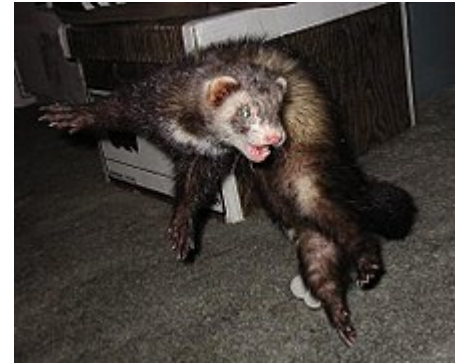
A ferret in a war dance jump.

Like many household pets, ferrets require a cage. For ferrets, a wire cage at least 18 inches long and deep and 30 inches wide or longer is needed. Ferrets cannot be housed in environments such as an aquarium because of the poor ventilation. [40] It is preferable that the cage have more than one level but this is not crucial. Usually two to three different shelves are used.