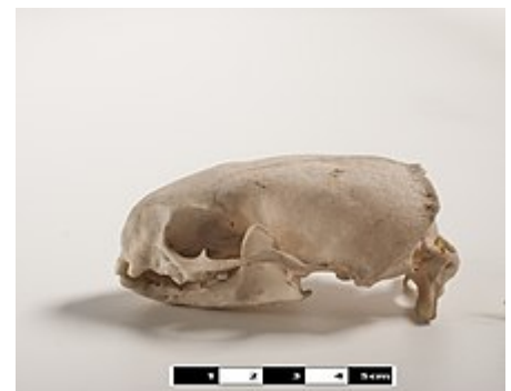
Skull of a ferret

As with skunks , ferrets can release their anal gland secretions when startled or scared, but the smell is much less potent and dissipates rapidly. Most pet ferrets in the US are sold descended (anal glands removed). [16] In many other parts of the world, including the UK and other European countries, de-scenting is considered an unnecessary mutilation .