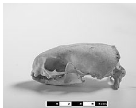
Skull of a ferret

As with skunks , ferrets can release their anal gland secretions when startled or scared, but the smell is much less potent and dissipates rapidly. Most pet ferrets in the US are sold descented (anal glands removed). [16] In many other parts of the world, including the UK and other European countries, de-scenting is considered an unnecessary mutilation .