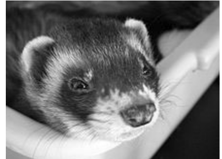
Typical ferret coloration, known as a sable or polecat-colored ferret

Gaston Phoebus' Book of the Hunt was written in approximately 1389 to explain how to hunt different kinds of animals, including how to use ferrets to hunt rabbits. Illustrations show how multicolored ferrets that were fitted with muzzles were used to chase rabbits out of their warrens and into waiting nets.