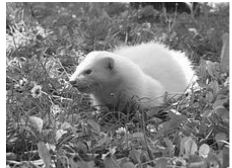
White or albino ferret