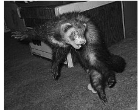
A ferret in a war dance jump.

Like many household pets, ferrets require a cage. For ferrets, a wire cage at least 18 inches long and deep and 30 inches wide or longer is needed. Ferrets cannot be housed in environments such as an aquarium because of the poor ventilation. [40] It is preferable that the cage have more than one level but this is not crucial. Usually two to three different shelves are used.